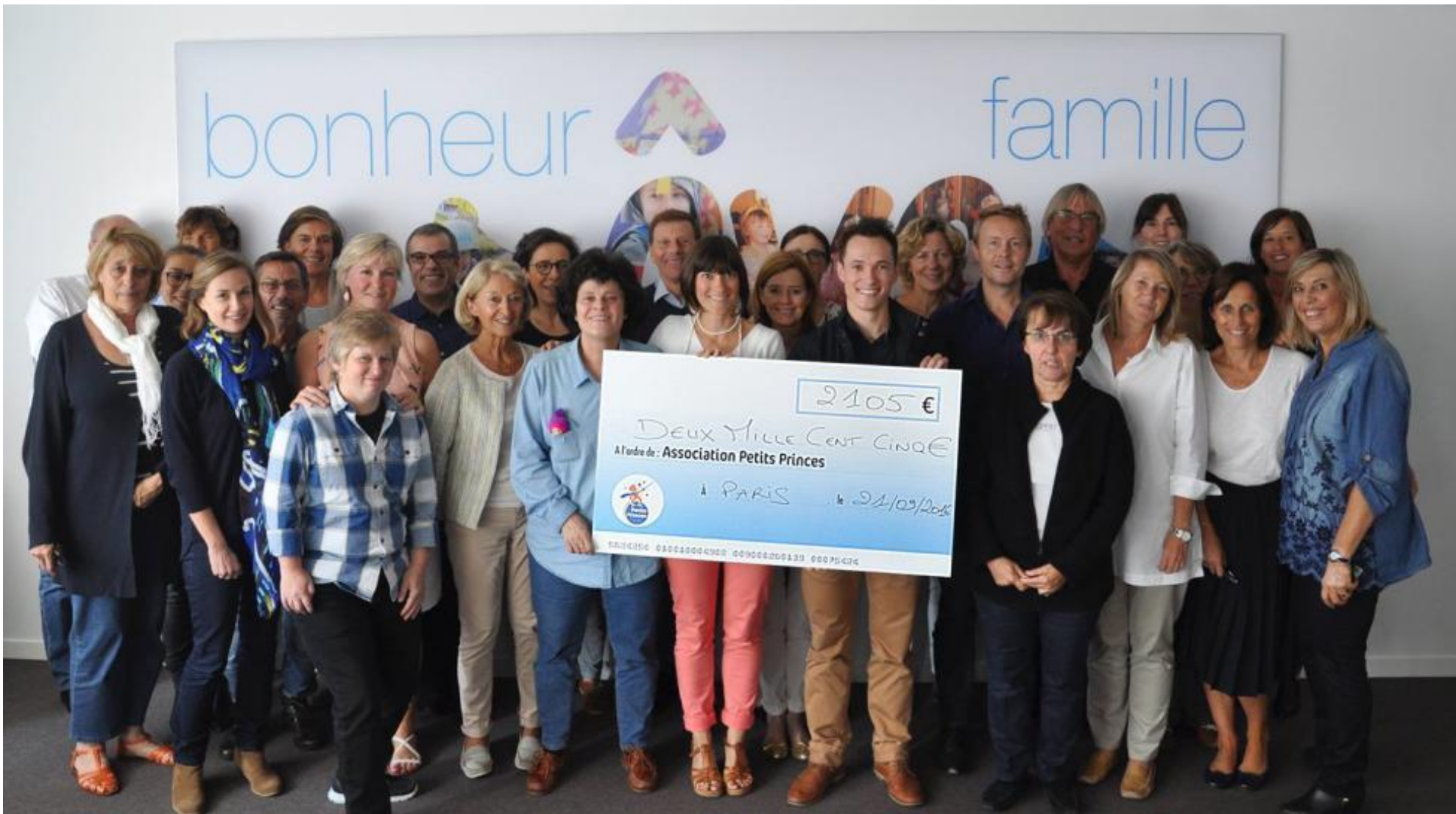
Paris September 2016