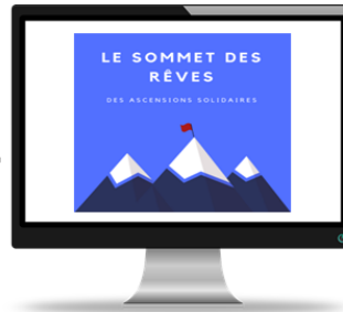
Creating a website