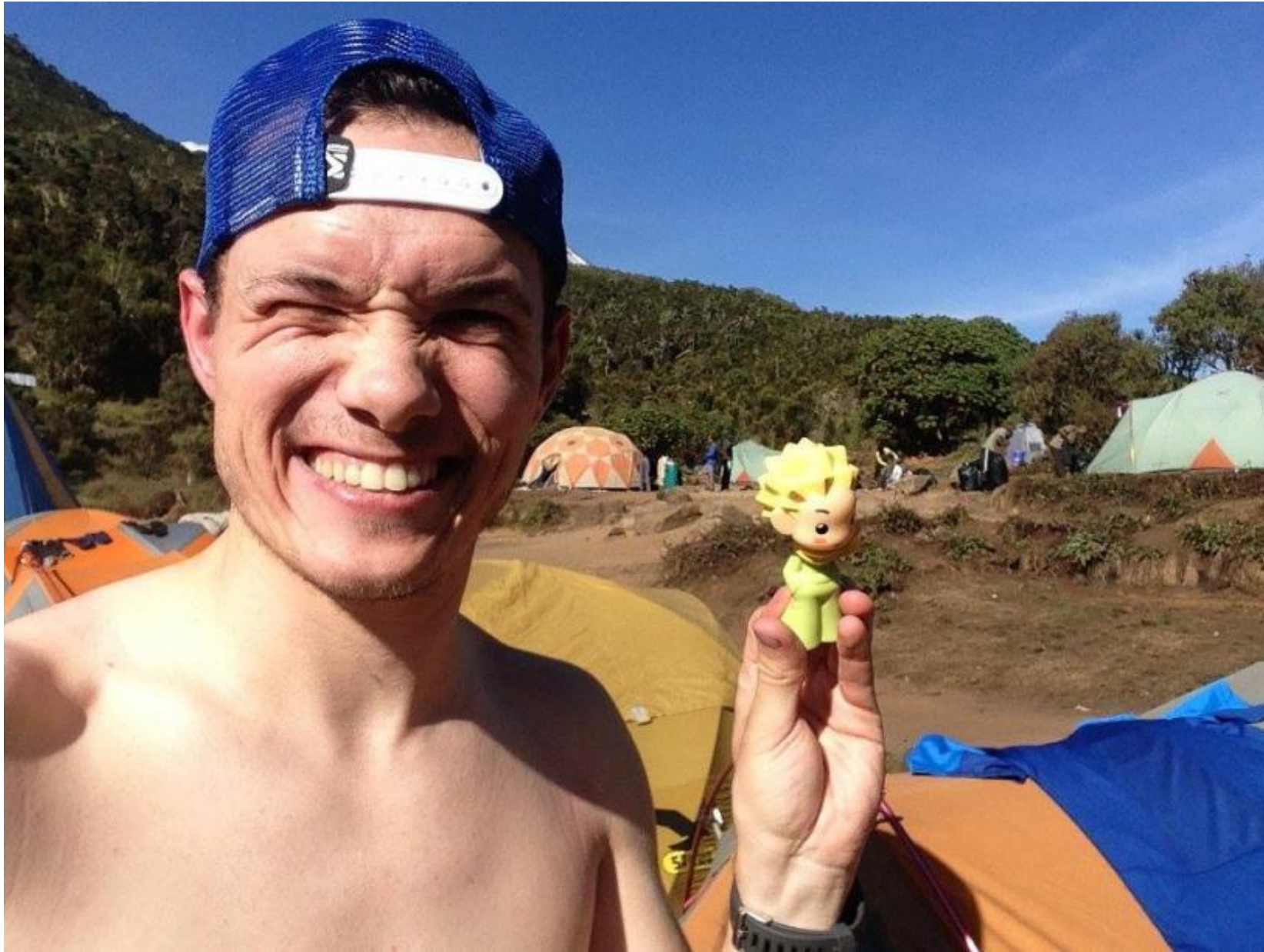
Kilimanjaro July 2016