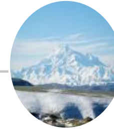
Mount Elbrus 5 642m