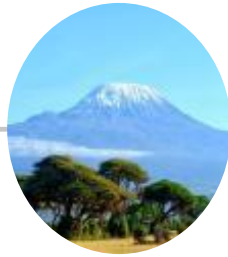
Kilimanjaro 5 895m