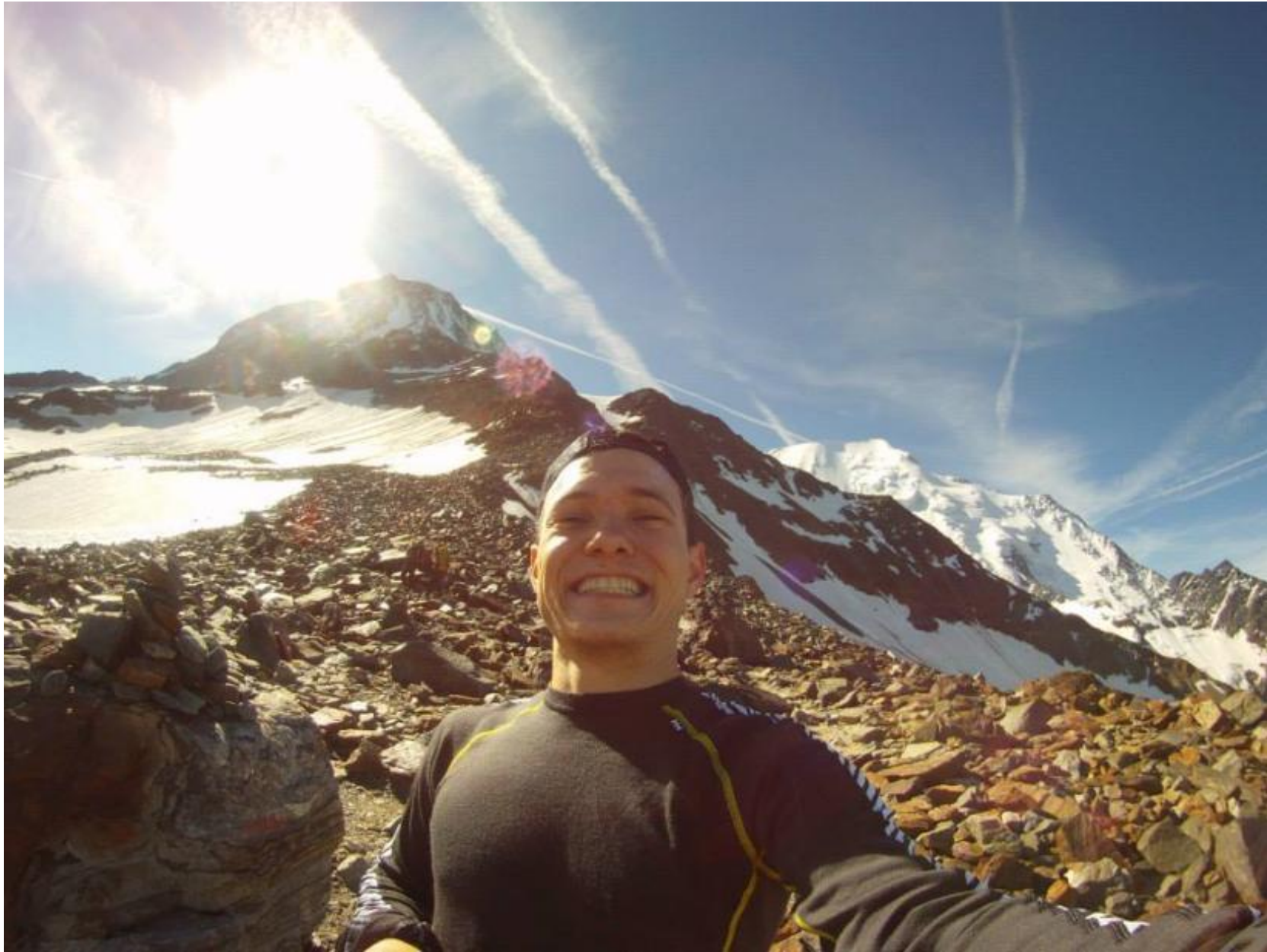
Mont Blanc July 2014